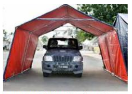
Low Cost Vehicle Sanitization Enclosure

This system is lightweight, portable canopy and can be made operational in three hours to sanitize vehicles at entry points of premises. An electrically operated positive displacement pump creates disinfectant mist inside the tent canopy through which the vehicles are passed. A 500 L