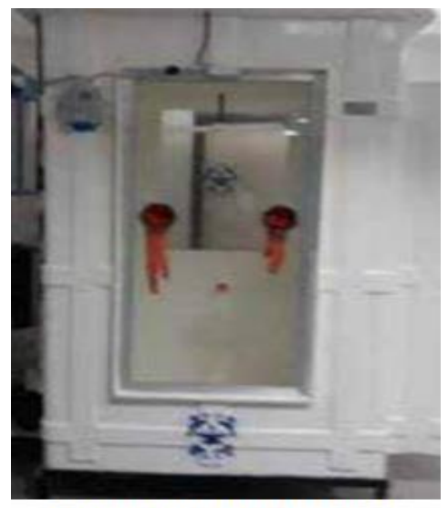
COVID Sample Collection Kiosk

COVID Collection Sample Kiosk (COVSACK) unit has been developed by Hyderabad-based Defence Research and Development Laboratory in consultation with the doctors of Employees' State Insurance Corporation (ESIC), Hyderabad. The COVSACK is a kiosk for use by healthcare workers for taking COVID-19 samples from suspected infected patients. Patient under test walks into the kiosk and a nasal or oral swab is taken by a healthcare professional from