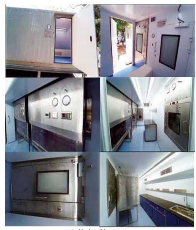
Inside view of the MVRDL

ICMR Bio Safety Standards to meet international guidelines. The system has built-in electrical controls, LAN, telephone cabling and CCTV. The Mobile Laboratory will be helpful to carry out diagnosis of COVID-19 and also virus culturing for screening, convalescent drug derived plasma therapy, comprehensive immune profiling of COVID-19 patients towards vaccine development and for early clinical trials specific to Indian population. The developed