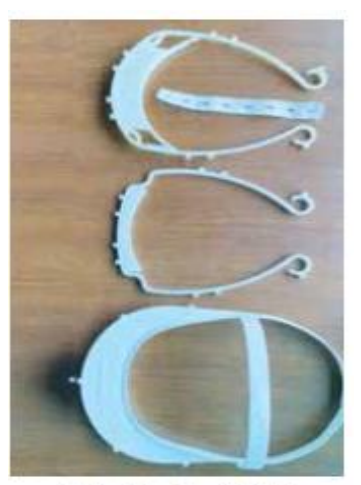
Protective Face Shield

Research Centre Imarat (RCI) Hyderabad, TBRL, Chandigarh and HPO-1, DRDO HQ, New Delhi has developed face protection shields for health care professionals and security forces handling COVID-19 patients. All the designs are lightweight and have negligible aerosol movement at face to minimize contamination from direct splash and sneezing. The face mask is being mass produced using injection moulding technique at Delhi, Chandigarh, Hyderabad and Bengaluru. A total capacity of approximately 2 lakh