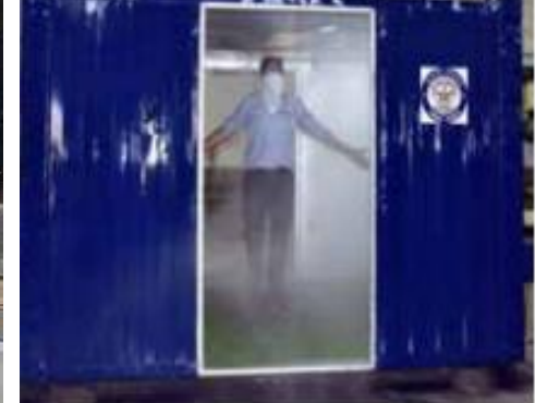
Personal Sanitization Enclosure