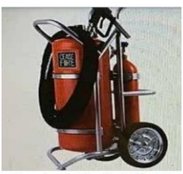
Large Area Sanitization Equipment