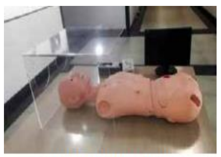
Aerosol Containment Box

Research Centre Imarat (RCI), Hyderabad and Terminal Ballistic Research Laboratory (TBRL), Chandigarh have come up with Enclosure for Intubation Procedure-Aerosol Containment Box to safeguard health care workers. The enclosure prevents spread of viral contamination of COVID-19 to reach the gown, gloves, face mask, eye